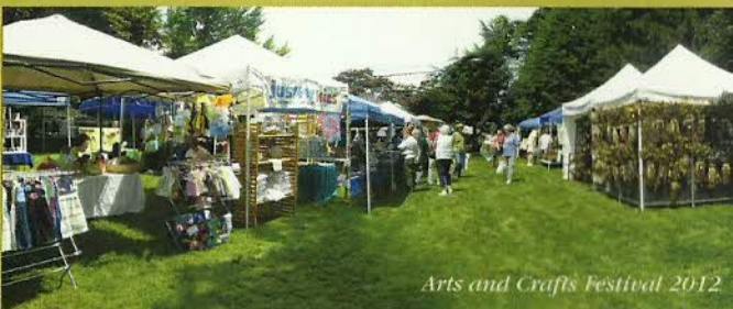
Arts and Crafts Festival 2012